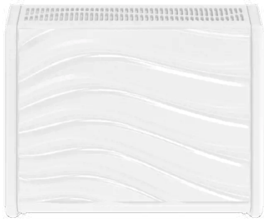
DRY WAVE 300 - 400

The DRY Wave product line is designed for indoor pools, wellness centers, and hot tubs. Its modern wave-shaped design not only enhances aesthetics but also ensures efficient dehumidification and heat recovery. The unit operates quietly, making it suitable for environments where noise levels are a concern. With multiple installation and control options, it offers flexibility to meet various user needs.