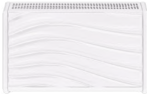
DRY WAVE 500