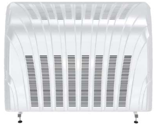
DRY WAVE 800 - 1200