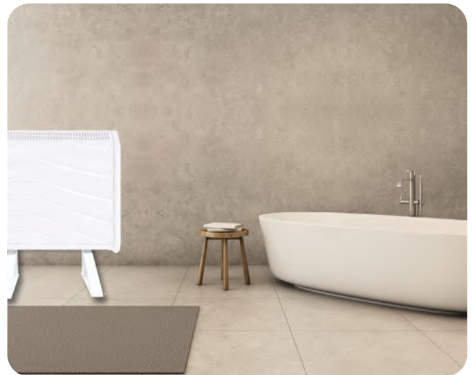
Fixed floor stand