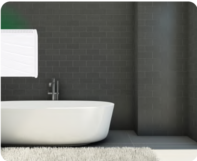
Standard: on the wall

Microwell offers customized, on-demand solutions tailored to your needs – at prices comparable to serial production. Choose from 25 base models and 50+ accessories to create a unit that fits your space and performance goals. Customize with over 200+ color options , various temperature ranges , installation types (wall-mounted, floor-standing, mobile, behind-the-wall, or ducted), extra heating (water or electric), fresh air intake, smart controls, and humidity visualization via microLIGHT+ . If others didn't have the solution – we just might. Request your tailor-made design today.